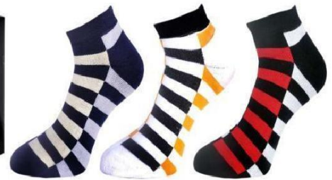
3 PAIR COMBO SOCKS